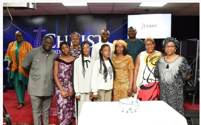
APRIL CELEBRANTS IN PICTURE

Obedience shows trust. Humility keeps us dependent on Him, not ourselves, Humility says, "I trust You, Lord.